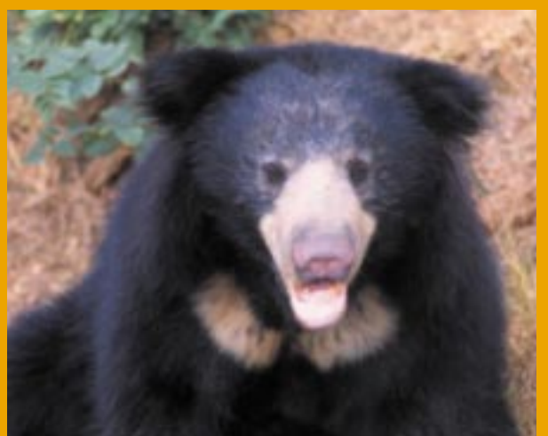
Sloth Bear ( Melursus ursinus )

Found in SE Asia Captured for the pet trade Suffers from destruction of habitat Number left in wild unknown