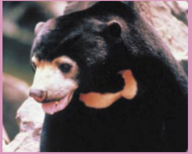
Sun Bear ( Helarctos malayanus )

Found in SE Asia Killed for its gall bladder & farmed for extraction of its bile Used in bear-baiting events Around 50,000 left in wild