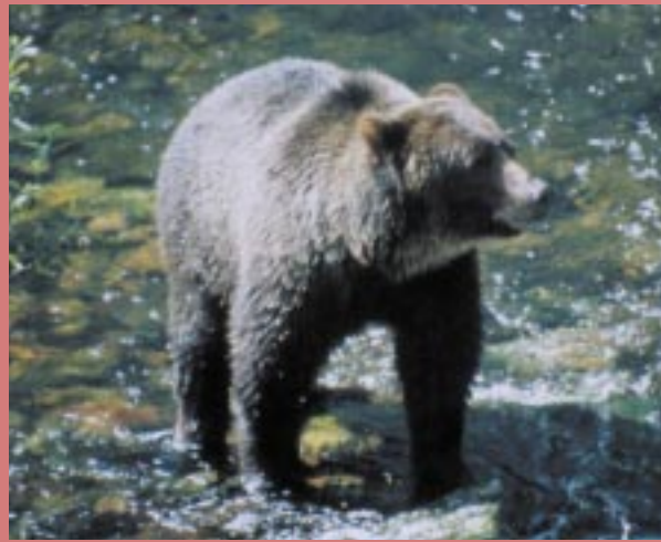
Brown Bear ( Ursus arctos )

Found in Arctic regions of Canada, Greenland, Norway, Russia & USA Destruction of habitat Threatened by trade in gall bladders Between 21-28,000 left in wild