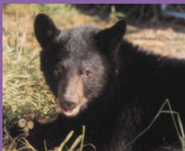
American Black Bear ( Ursus americanus )

Found on S.American Continent Suffers from severe destruction of habitat Shot as a pest by farmers Less than 20,000 left in wild