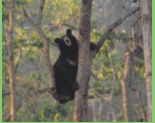
Asiatic Black Bear ( Ursus thibetanus )

Found only in China Vulnerable to inbreeding On the verge of extinction through destruction of habitat 1,000 left in wild