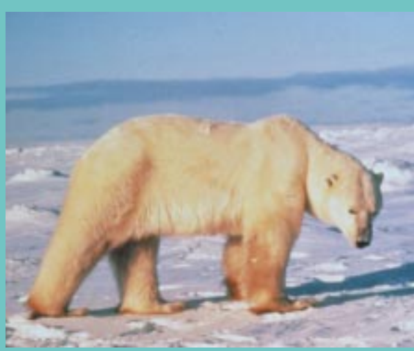
Polar Bear ( Ursus maritimus )

Found in Arctic regions of Canada, Greenland, Norway, Russia & USA Destruction of habitat Threatened by trade in gall bladders Between 21-28,000 left in wild