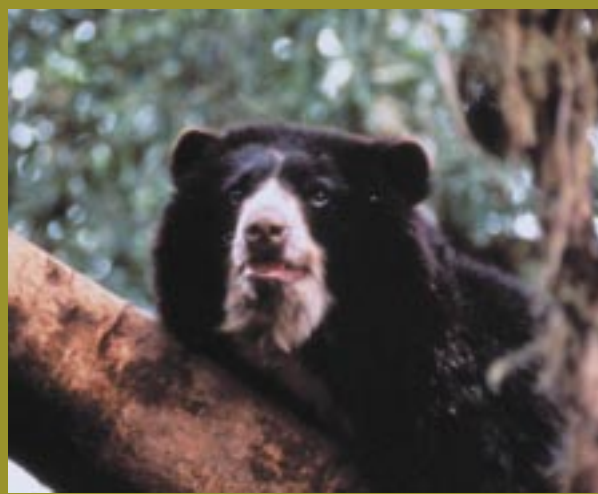
Spectacled Bear ( Tremarctos ornatus )

Found in North America, Asia & Europe. Hunted for sport Used as a "dancing" bear Poached for its gall bladder Less than 180,000 left in wild