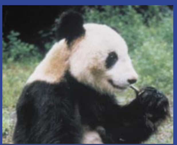
Giant Panda ( Ailuropoda melanoleuca )

Found on North American Continent Hunted for sport Poached for its gall bladder Less than 700,000 left in wild